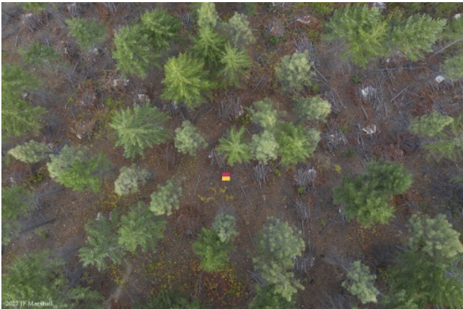
Tillicum Unit 27 Aerial Photo Post Treatment