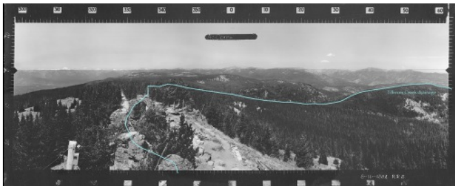
Osborne Panoramas from Sugarloaf Peak looking North in 1934 - Outline added