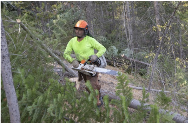
2022 thinning activity in Tillicum project