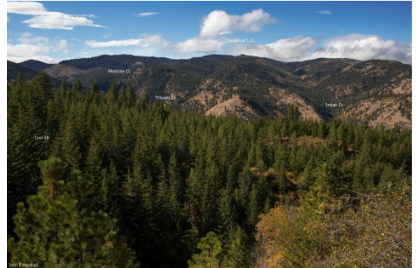
Tillicum Landscape Perspective - Annotated