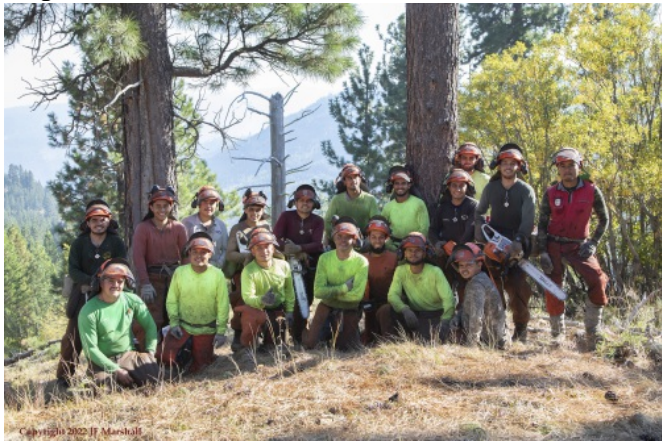
Contract crew implementing fuels reduction in the Tillicum project. October 2022.