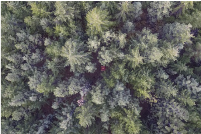
Tillicum Unit 28 Aerial Photo Pre-Treatment