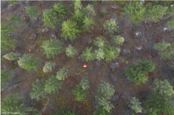
Tillicum Unit 27 Aerial Photo Post Treatment