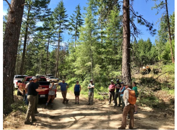
DNR Forest Resiliency staff tour of commercial thin units during implementation in June 2021, including a stop with AFM project leads.