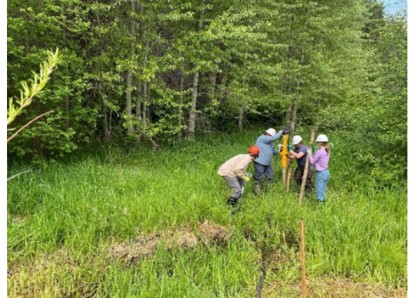
Beaver Dam Analog Construction - spring 2022.