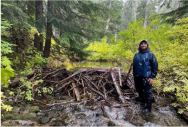
Beaver Dam Analog - Spring 2022.