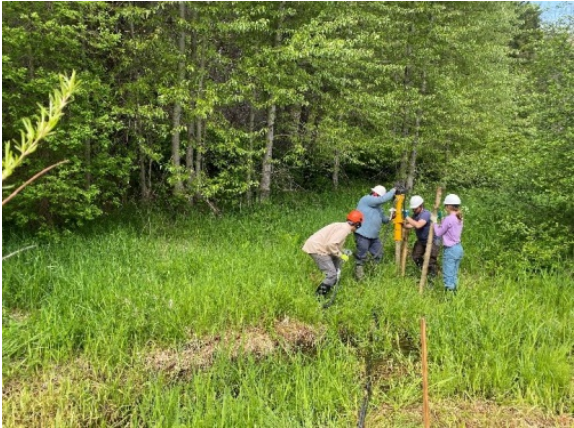
Beaver Dam Analog Construction - spring 2022.