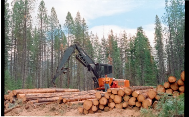
Implementation of Meadows Sale in Upper Wenatchee Pilot Project in October 2024.