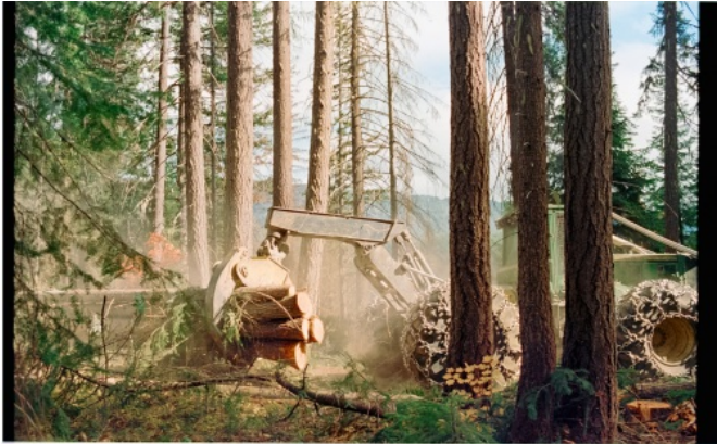
Implementation of Meadows Sale in Upper Wenatchee Pilot Project in October 2024.