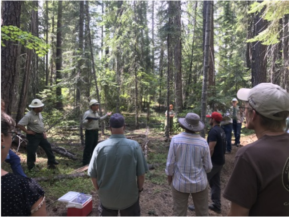
2019 Upper Wenatchee Pilot Project Partner Field Tour