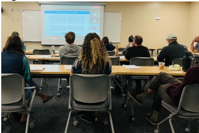
Classroom photo from Certified Burner Course in Pasco, fall 2024