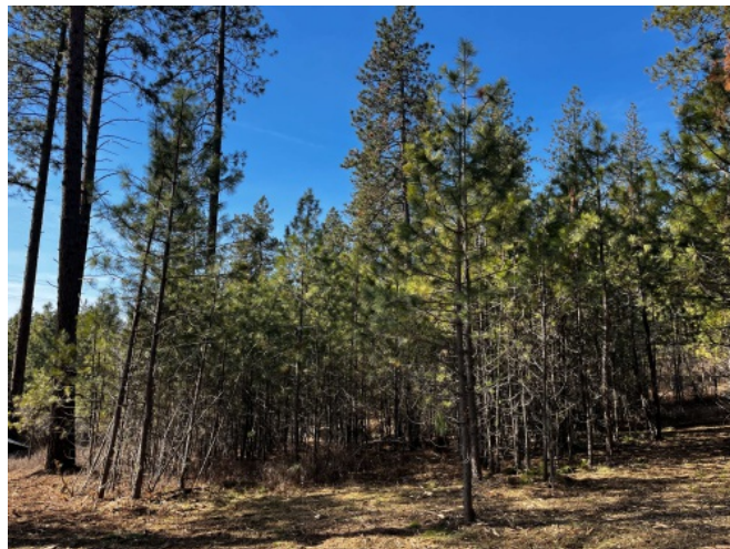
Stand before treatment