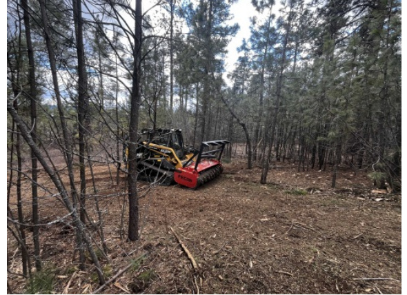
Masticator implementing fuels reduction work during project implementation in 2024.