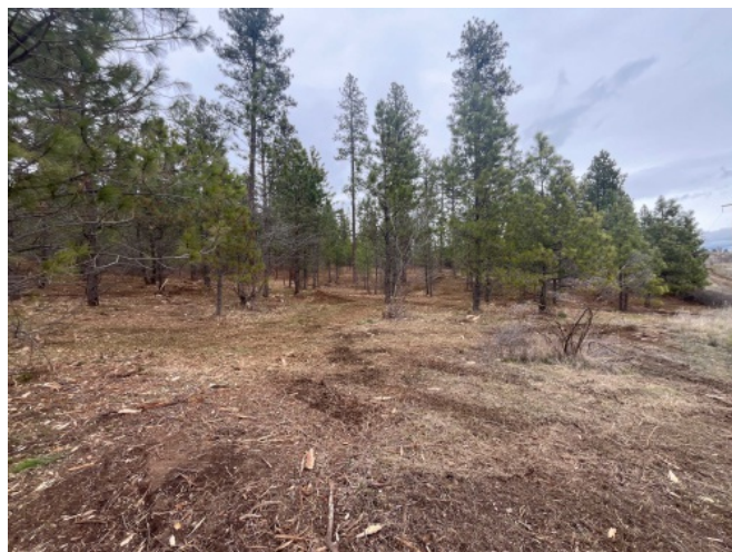
Masticated Acreage During Implementation in 2024.