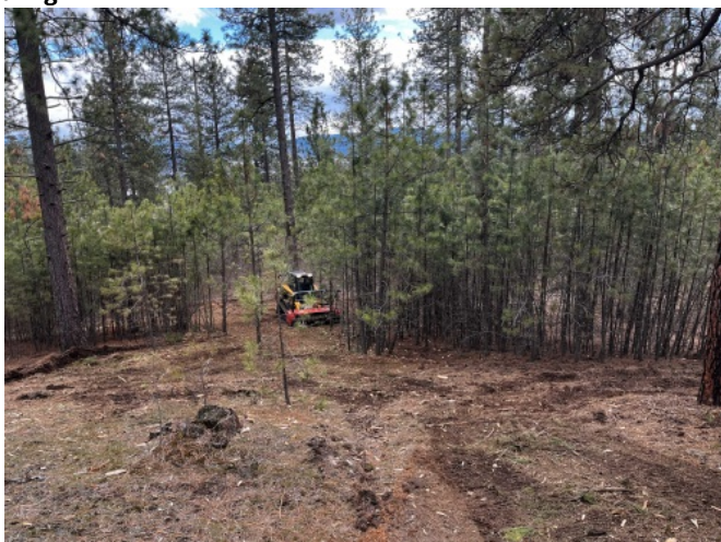
Masticator implementing fuels reduction work during project implementation in 2024.