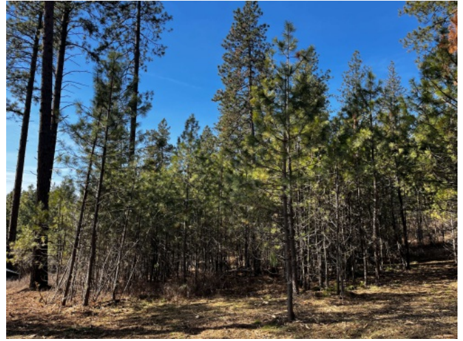
Stand before treatment