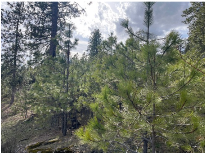
Stand before treatment