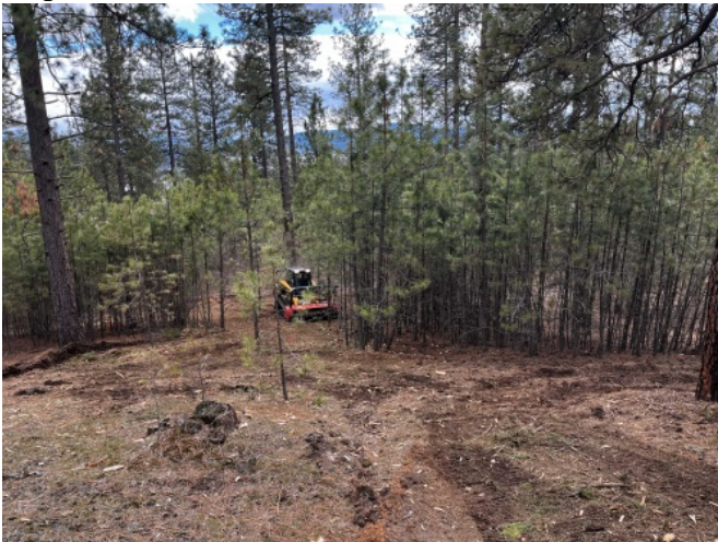
Masticator implementing fuels reduction work during project implementation in 2024.