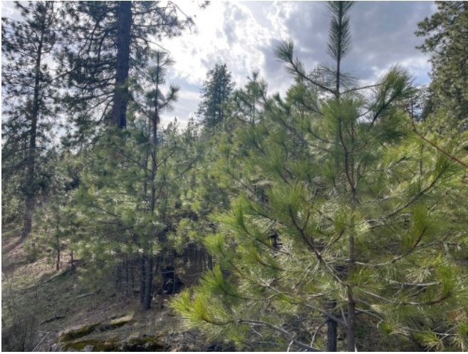
Stand before treatment